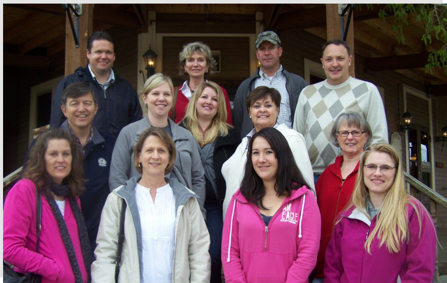
Participants at the West River Planning Day on April 27, 2012